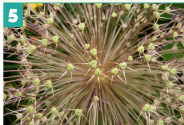
Allium seed head